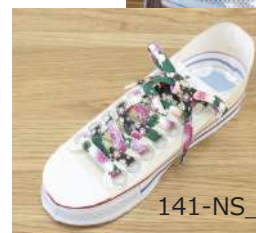
Assembly type (Right side only)