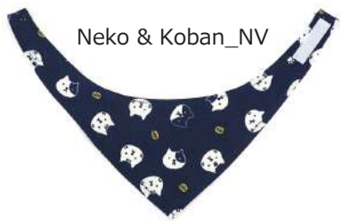
Neko & Koban_NV

Size: Neck circumference approx. 5.5 in - 7.0 in.