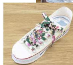
Assembly type (Right side only)