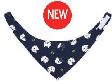
Neko & Koban_NV